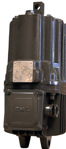
ELDROclassic® AFTER overhauling

Keep your ELDROclassic® or ELHY® thruster at the highest performance level and use our repair service!