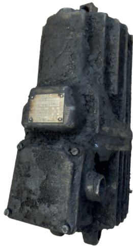
ELDROclassic® BEFORE overhauling

and at authorised repair workshops worldwide